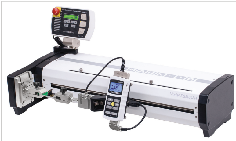
^ ESM303H is shown above configured for a peel test, with a Model M7i indicator, Series R01 load cell, and G1008 film and paper grips.

The ESM303H is a highly configurable horizontal force tester for tension and compression measurement applications up to 300 lbF [1.5 kN], with a rugged design suitable for laboratory and production environments. Sample setup and fine positioning are a breeze with available FollowMe™ force-based positioning - using your hand as your guide, push and pull on the load cell to move the crosshead at a variable rate of speed.